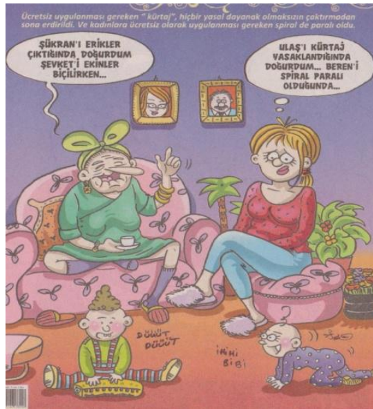
Figure 2. “I gave birth to Şükran when plum trees fructified and I gave birth to Şevket during the harvest”, “I gave birth to Ulaş when abortion was banned and I gave birth to Beren when coil contraception became paid” ( Bayan Yarı Humour Magazine, 2015 January, 38: 11, reprinted with the permission of the magazine administration.)

contemporary Turkey associate the births of their children with government policies on reproduction. She looks uneasy and anxious as opposed to the older woman. Her associations related to motherhood are not related with natural concepts such as fructifying trees or the harvest, but with politics. The caption above Abortion, which should be practiced free of charge, has been terminated stealthily without any legal basis, and coil contraception, which should be an unpaid service became a paid one clarifies the effects of politics on the reproduction of women. This caricature has a less offensive tone and humour here serves a relieving function. It reflects self-disclosure and sharing. This type of humour has a healing function as women become able to laugh at things that distress them and as they realize they are not the only ones going through those processes. For these reasons, it can be argued that this caricature serves the functions of creating solidarity and satisfying psychological needs.