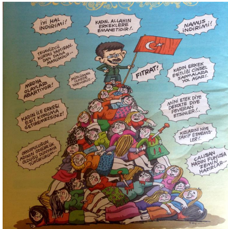
Figure 6. "God entrusts women to men." ( Bayan Yanı Humour Magazine, 2015, March, 40: 64, reprinted with the permission of Feyhan Güver, the creator of the caricature.)

The reference in the first balloon, "I will spit on the world in which prostitution is called freedom..." has already been analysed in the section devoted to Figure 3. The second balloon "You cannot make men and women equal!" is criticism directed at the current president of Turkey as he made this statement. He justified his point with the argument that it is against disposition and that feminists reject maternity. The words "The media is dramatising the