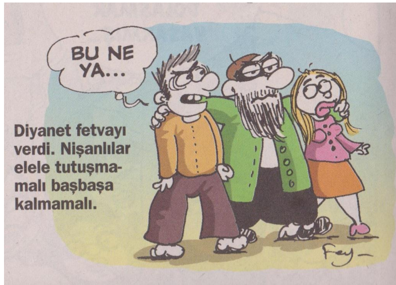
Figure 5. “What is this ...” ( Bayan Yanı Humour Magazine, 2016, January, 49: 2, reprinted with the permission of Feyhan Güver, the creator of the caricature.)

The last caricature included in the sample (Figure 6) summarises the main lines of criticism reflected in the humour magazine. The former Prime Minister of Turkey Ahmet Davutoğlu is depicted on a pile of murdered women. He is waving the Turkish flag proudly, as if he had gained a victory. The implied message is that the government purposefully turned a blind eye on the issue of the murders of women as this situation served its strategic purposes. The balloons all around the pile from the bottom left to the right say: “I will spit on the world in which prostitution is called freedom...”; “You cannot make men and women equal!”; “The