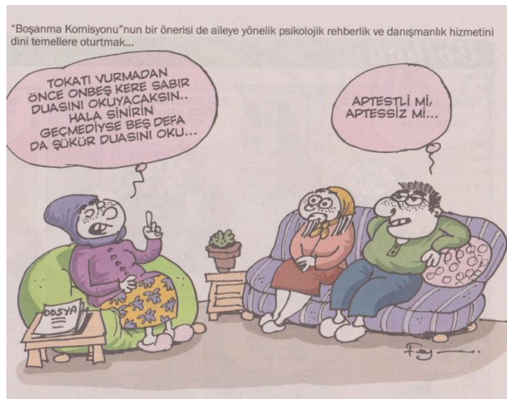
Figure 1. “Should I perform an ablution beforehand or not” ( Bayan Yanı Humor Magazine , 2016, June, 54: 3, reprinted with the permission of Feyhan Güver, the creator of the caricature.)

The first caricature included in the sample of this study was introduced with the caption One of the suggestions of 'the committee on divorce' is to base psychological guidance and counselling to families on religious principles.